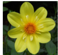
Baron Aunt Dorothy

The American Dahlia Society announces the 2012 dahlia seedling winners of the Lynn B. Dudley Medal and Evie Gullikson Medal. Dahlia seedling blooms are exhibited and evaluated in the Seedling Bench Section of ADS dahlia shows. Cultivars receiving the highest average scores across the United States and Canada will receive medals. These dahlias will be introduced as new varieties for 2013 with the added designation of being medal winners.